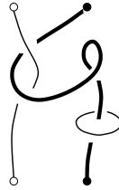
Figure 1: Diagram of a two colored tangle